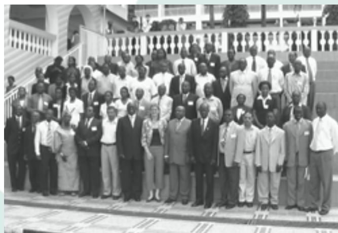
The Minister for Health (7th from right, front row) and participants in the Kampala symposium.