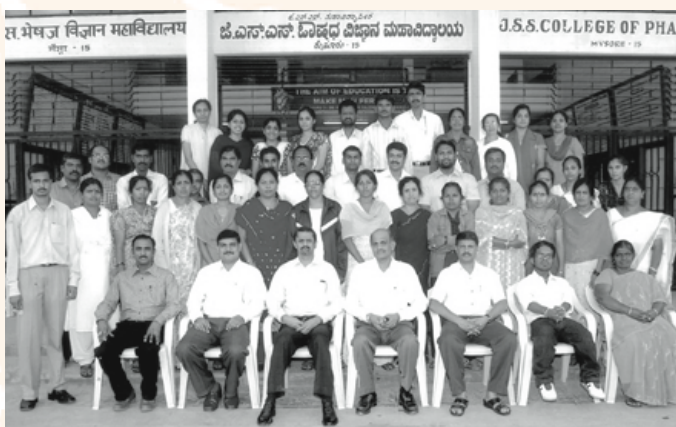
Trainers and participants in the SMART workshop in Mysore

RNTCP centres attached to a primary health centre, staffed with a medical officer, pharmacist and TB health visitor, were identified in consultation with the District TB Medical Officer. Workshops on 'Safety Monitoring of Anti-TB Therapy', sponsored by the Mysore Physicians Medical Research Trust, were organized for sentinel site personnel. Ten medical officers, eight pharmacists, ten TB health visitors, six nurses and ten other staff of RNTCP centres were trained in ADR detection, reporting and patient counselling. A SMART trigger tool was developed and implemented to assist the personnel in detecting ADRs to ATT. Health visitors participating saw that such projects help develop their skills and improve their contribution to the success of RNTCP.