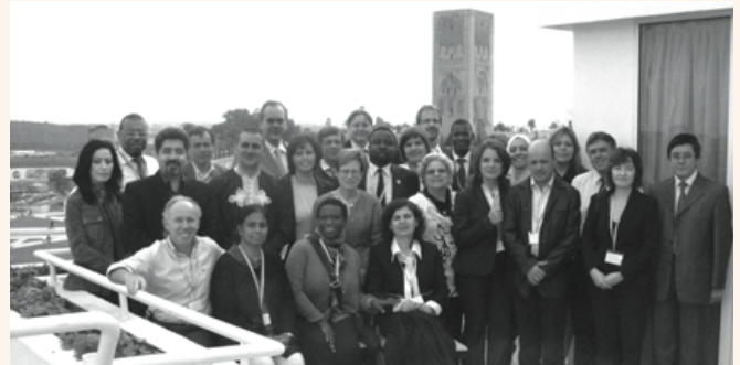
Members of the Global Network on the roof of their conference venue, with the Tour Hassan in the background.

VigiFlow™ will be the standard means for reporting by the majority of network countries. In preparation for regular reporting of AEFIs by network countries, in-country training on VigiFlow has been