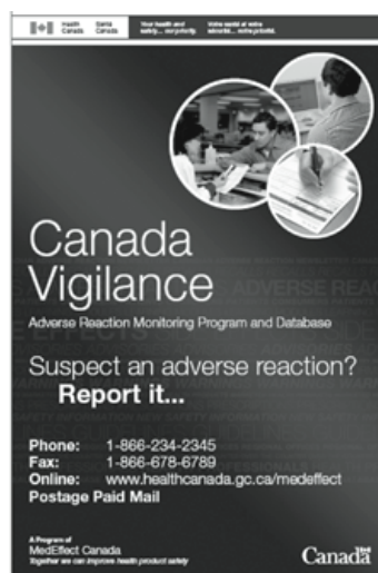
Canada Vigilance promotional Poster

business transformation and data-mining project underway. The Canada Vigilance Database will also eventually manage adverse reactions from clinical trials. Thus the database will track adverse reactions over the entire lifecycle of a product from clinical trials through to its experience in widespread use once it is approved. The second phase of implementation will utilize the system's capacity to handle electronic filing of adverse reaction reports pre-coded in MedDRA from market authorization holders (MAH), who are mandated to report adverse reactions to products they market in Canada.