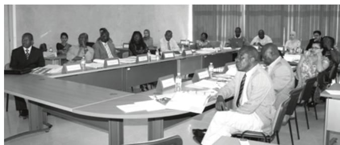
The course in Rabat.

The course, conducted in French, included exercises in causality assessment, VigiFlow, bibliographical research; many working groups about aspects of ADR reporting forms, and how to develop a pharmacovigilance centre according to WHO guidelines; and planning action to implement a pharmacovigilance system.