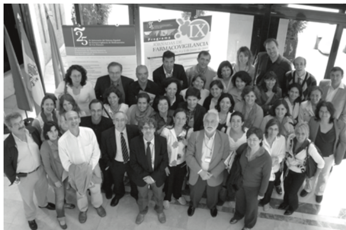
Pharmacovigilance staff of the Spanish Human Pharmacovigilance System at the 25th anniversary meeting.

More than ten oral presentations and 73 posters about a wide range of pharmacovigilance issues included: hospital programmes, issues with oral anticoagulants, bisphosphonates and hip fractures, a pharmacovigilance teaching project for general practitioners, electronic submission of ICSRs between the Spanish Medicines Agency, AEMPS, and pharmaceutical companies, observational post-authorisation studies and results of different strategies to promote spontaneous reporting.