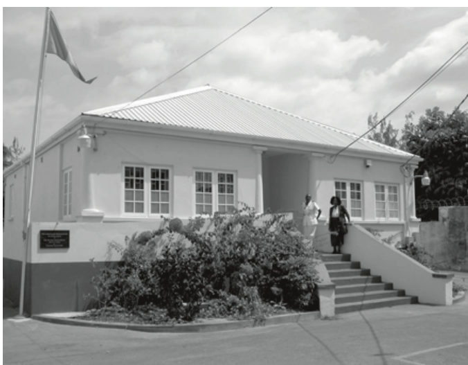
The main building for pharmacovigilance activity in Barbados.

So far, the Barbados Drug Service, the agency responsible for pharmacovigilance on the island, has designed a reporting form and disseminated it to the main hospital, polyclinics and private health facilities. Medical practitioners have been informed about the reporting and attempts are on-going to engage with pharmacists.