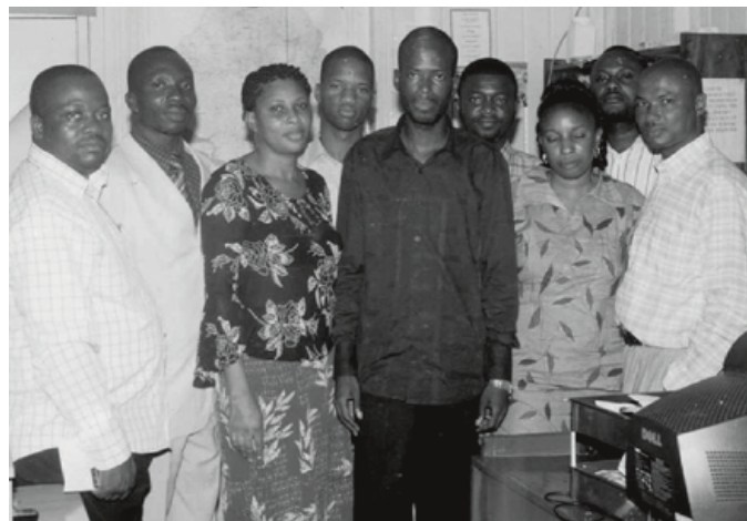
Staff at the Sierra Leone national centre.

Our programme is hosted by the Drug Information and Pharmacovigilance Department (DIPD) of the Pharmacy Board of Sierra Leone which serves as the National Pharmacovigilance Centre. The programme was launched in 2006; in August 2008 a technical mission from WHO completed an assessment of the implementation of the drug safety monitoring programme (see UR43 p7). Sierra Leone attained full membership of the WHO Programme for International Drug Monitoring as its 87th member, in October 2008.