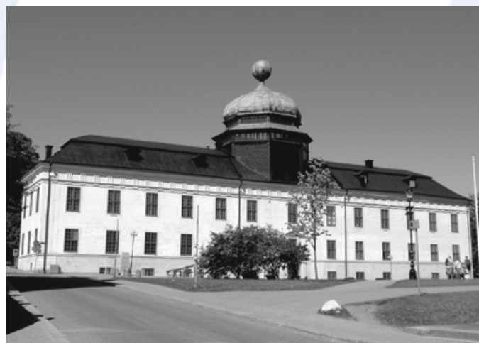
The ancient Gustavianum building, main course venue.

Building valuable new relations with other course participants and having a great time is as important as the scientific part of the training course. A number of social gatherings were arranged, including a welcome reception, an official course dinner and an opportunity to visit the UMC office and meet up for dinner in the evenings. The official course dinner took place on a boat along the Fyris river running through Uppsala, and gave participants a glimpse of the surrounding countryside. The main venue of the course, Gustavianum, also offered a unique environment as the oldest