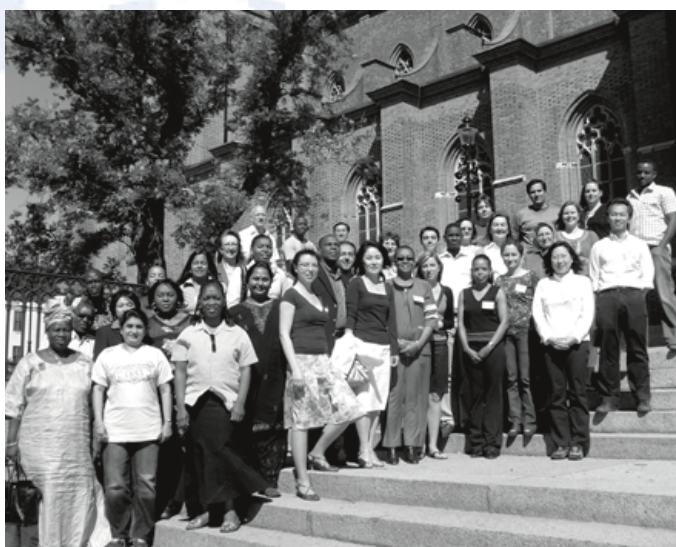
Course participants assembled on the steps in front of Uppsala cathedral.

The course is intended primarily to support the development of programmes for spontaneous adverse reaction reporting and to give an introduction to other methodologies, and as before, the course consisted of different modules. The first module, common for all participants, dealt with many aspects of pharmacovigilance in general, both theoretical and practical. The theoretical parts included lectures, group discussions and presentations of national pharmacovigilance systems by some of the participants. Practical sessions included recording of case information in, and retrieval of information from VigiBase.